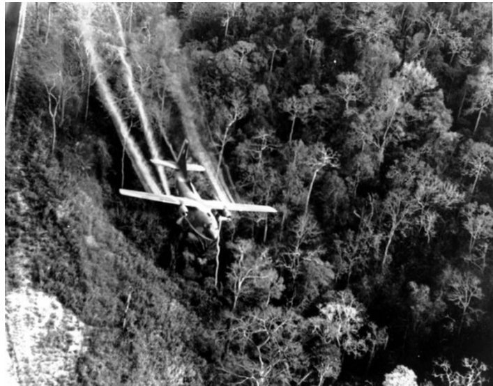
In this May 1966 file photo, a U.S. Air Force C-123 flies low along a South Vietnamese highway spraying defoliants on dense jungle growth beside the road to eliminate ambush sites for the Viet Cong during the Vietnam War.

Some Department of Defense officials were growing impatient with the slow pace of results so they expedited tests elsewhere under the cloak of the highly-secretive Project AGILE. 6 Although, some of the documents concerning AGILE show that defoliant experiments took place in Puerto Rico, Thailand and the mainland United States, the details of the other locations remain classified. Attempts to release the remaining files related to Project AGILE under the Freedom of Information Act have thus far been unsuccessful.