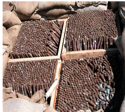
Figure 2 Military debris recovered from Fort Ord

Much of the debris and other munitions have been removed, but there are still sites where weapons are located beneath the ground’s surface. Most likely they were detonated long ago and do not present an explosive risk, but live munitions have been